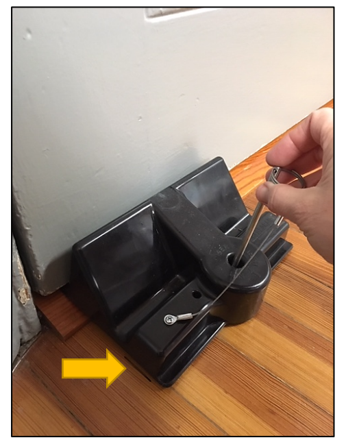
3. Position hole for locking pin over hole in floor and insert pin. Use black line to align device in correct position over hole.