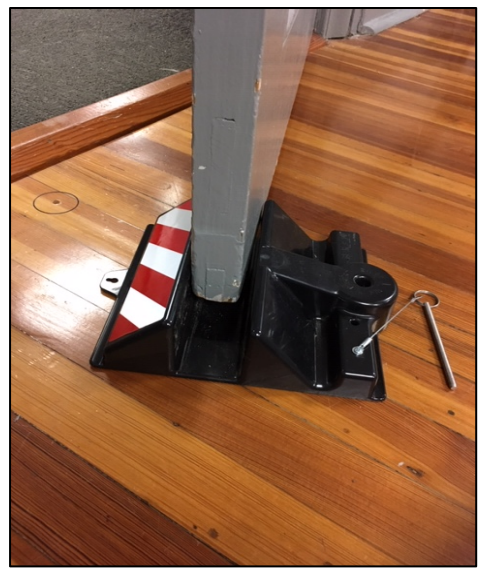
1. Slide Bearacade device onto door.