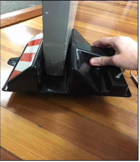
2. Lift up, so the device will clear the door jamb. Close door.