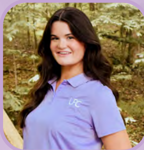
PHOTOGRAPHER & VIDEOGRAPHER