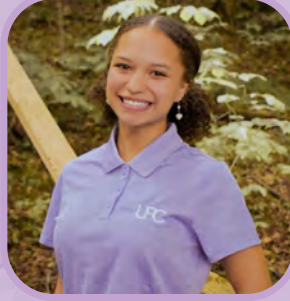
CO-CURRICULAR ACTIVITIES PLANNER