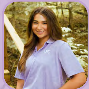
SOCIAL MEDIA MANAGER