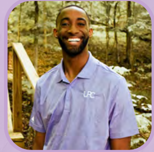
SPIRIT ACTIVITIES PLANNER