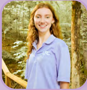
CAMPUS TRADITIONS ACT. PLANNER