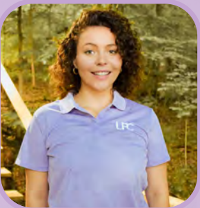
MARKETING & CAMPUS RELATIONS COOR.