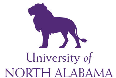
Do not remove the lion from the house.