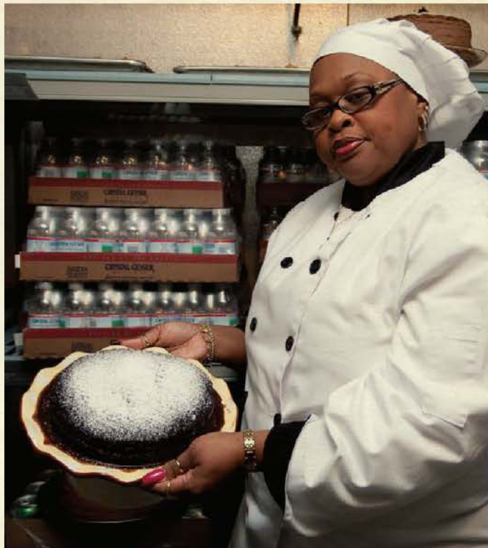
UNA 2011 Profiles in Excellence — Page 14

Presented, "Navigating Depression in the Menopausal Transition: Helping Women Find Their Way with Assessment, Advocacy, and Self-Care," Alabama Counseling Association Annual Conference, Mobile, AL, November 2010.