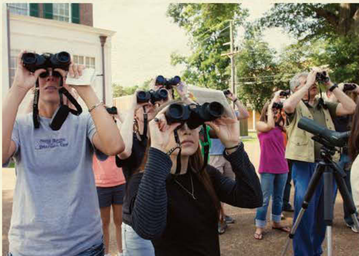
UNA 2011 Profiles in Excellence — Page 12

Co-presented, "Adventures in Professional Gatekeeping," Southern Association of Counselor Education and Supervision Conference, Williamsburg, Virginia. October 2010.